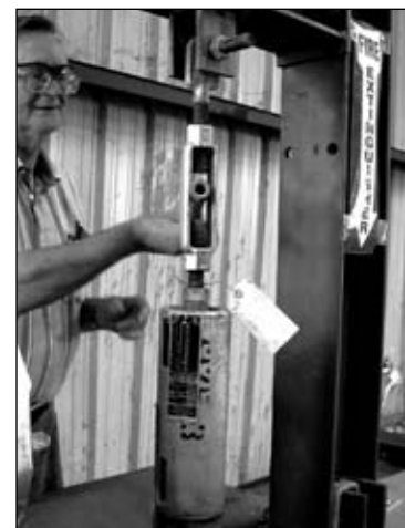
TESTING A SWAY BRACE