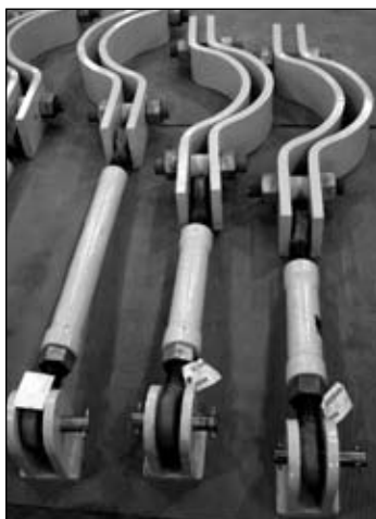
CLAMP AND SWAY STRUT ASSEMBLIES