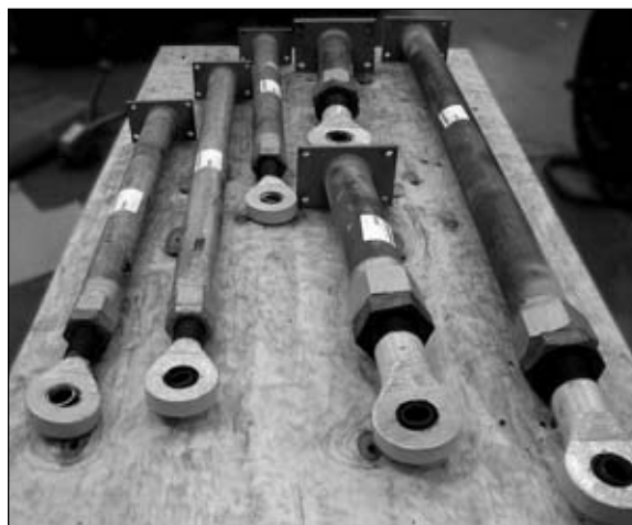
HYDRAULIC SNUBBER EXTENSION ROD ENDS