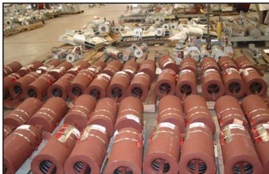
Custom Designed Furnace Spring Assemblies