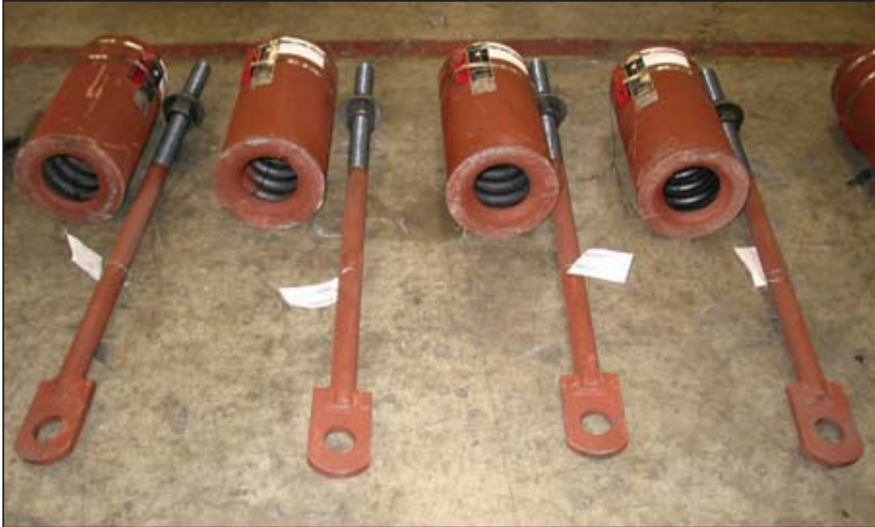
Custom Designed Furnace Spring Assemblies

Construction - Whereas many of the standard variable spring components are interchangeable, the furnace spring assemblies are constructed from components unique to its application and intended use. The furnace spring incorporates a welded design for the housing assembly unlike standard spring housings that use a bolted configuration. The internal components of the furnace spring are designed to center the spring coils within the spring's housing to prevent misalignment. In addition, the spring housing is modified to accommodate lug attachments on existing furnace tubing and equipment. Special fabricated casings, spring coils, and nameplates may also be used to accommodate increased travel.